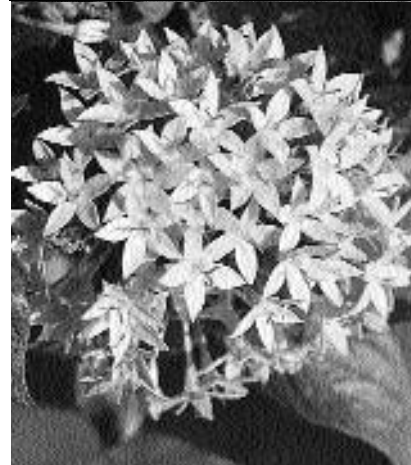
Pentas 'Piccolo Musk'