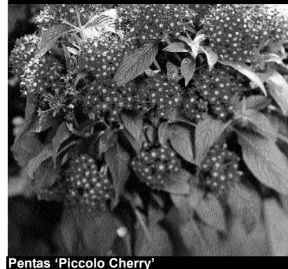
Pentas 'Piccolo Cherry'